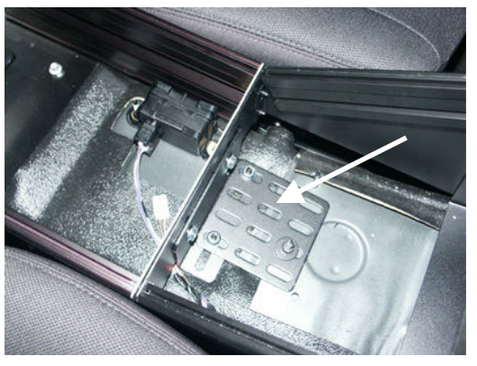
Place console assembly and install extension (#10) for "L" bracket mounting leg on stout console, using OEM hardware.